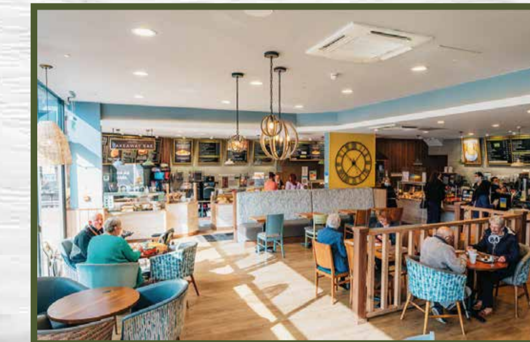
2020 – Despite the challenges of COVID we were delighted to open our 18th Boswells in Cwmbran