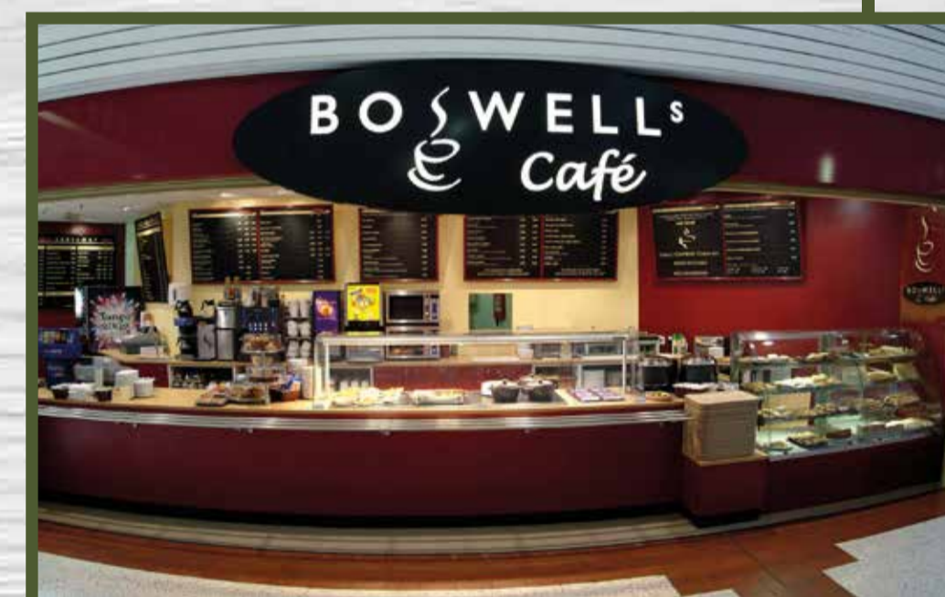
1996 – The birth of Boswells in Swindon, a new timeless and fresh brand to appeal to a new generation of café lovers, providing a "home from home", exceptional service and a menu with something for everyone.