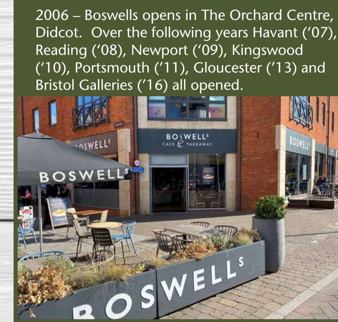
2006 – Boswells opens in The Orchard Centre, Didcot. Over the following years Havant ('07), Reading ('08), Newport ('09), Kingswood ('10), Portsmouth ('11), Gloucester ('13) and Bristol Galleries ('16) all opened.